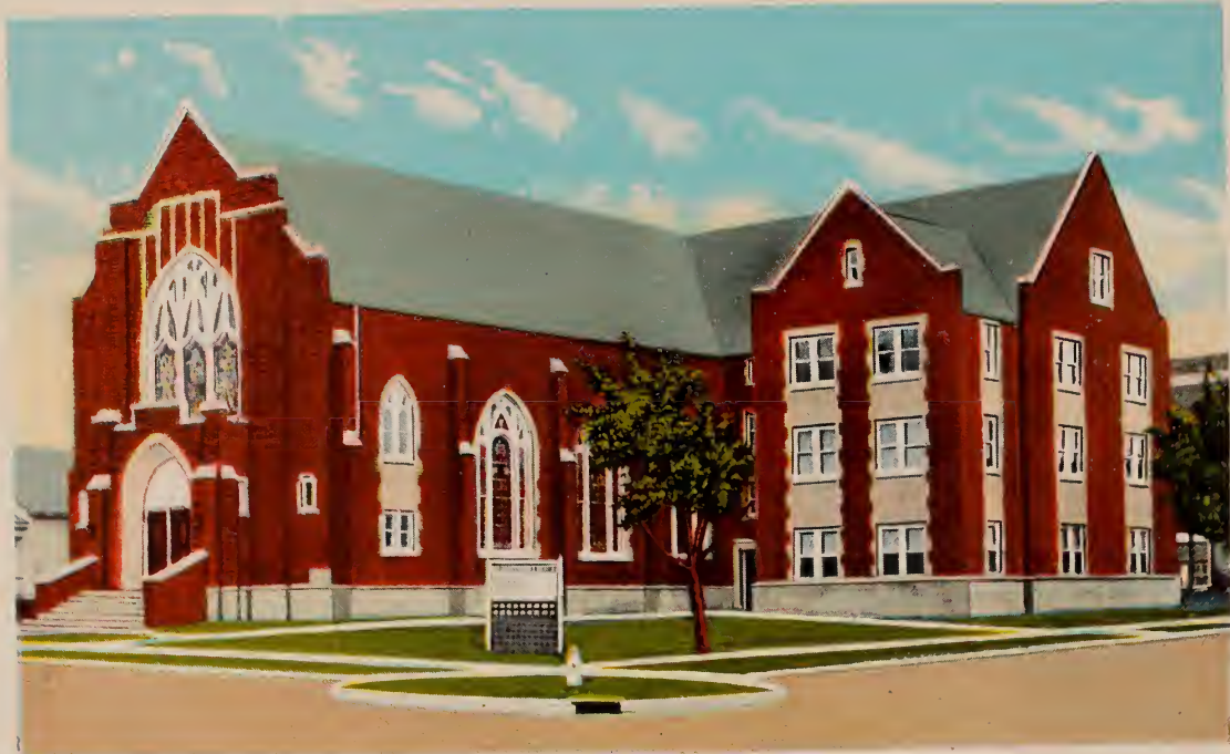
First Christian Church, Ada, Okla.